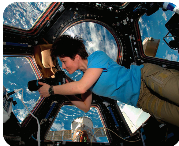
TWO FAMOUS ITALIAN PEOPLE: TIZIANO FERRO (SINGER) E SAMANTHA CRISTOFORETTI (ASTRONAUT)